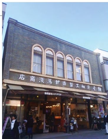
Now five businesses including a café and a kimono studio occupy the building.