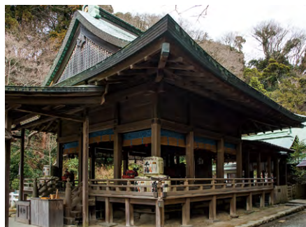
Leading Noh performers, such as the head of the Konparu school, perform Noh and Kyogen during the festival.