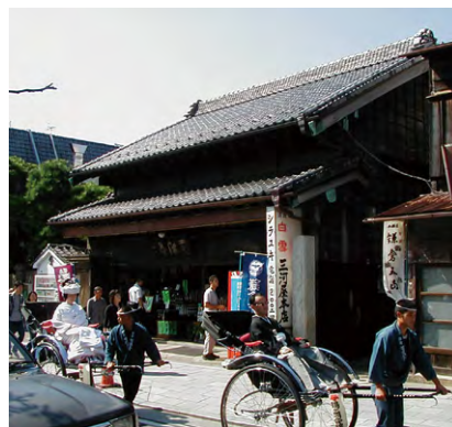
Stately building with intricately layered roofs and very long sashikamoi lintels.