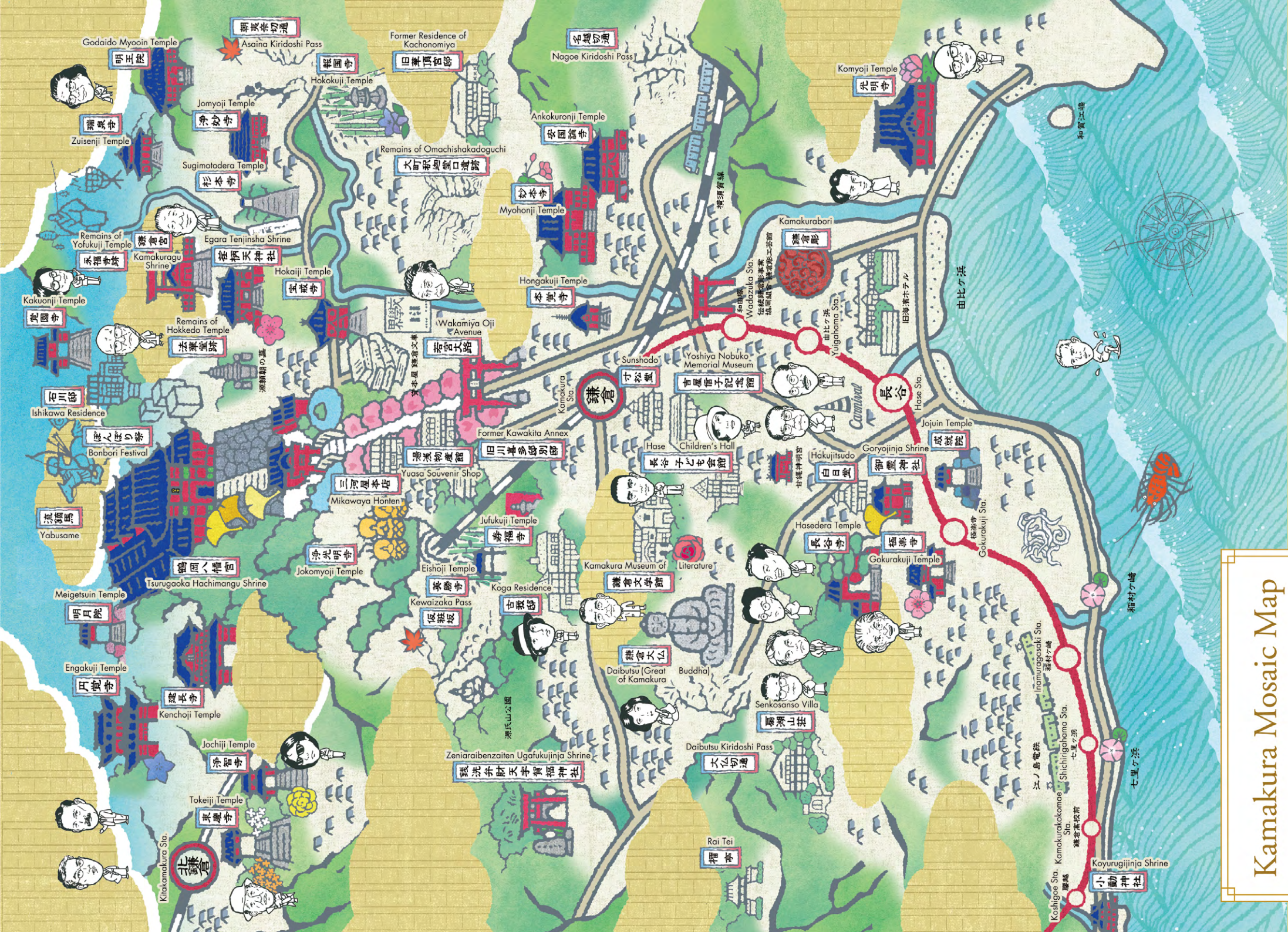
Kamakura Mosaic Map