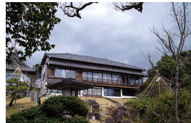
The stained glass and antiques of the villa create an interesting blend of Japanese and Western elements.