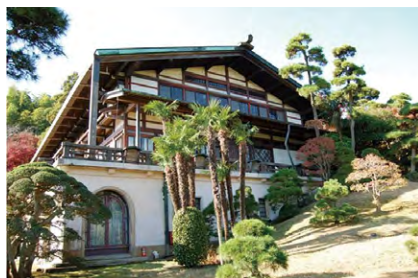
The main house is a two-story wooden building with a basement. There was a drawing room on the second floor.