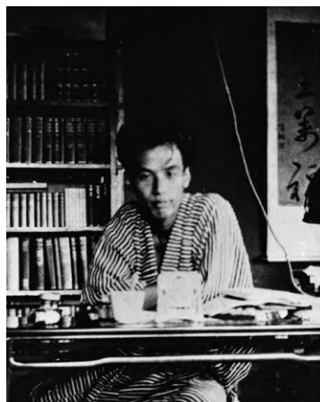
Akutagawa's study at the house in Omachi (current Zaimokuza), Kamakura, where he lived with his new wife.

After graduating from Tokyo Imperial University, Ryunosuke Akutagawa (1892-1927) started teaching English at the Naval Engineering College in Yokosuka, dreaming of becoming a writer. From 1916 to 1917 he boarded in Yuigahama near the Kaihin Hotel. In 1918 he and his new wife rented a house near Motohachiman and lived there for about a year. His time in Kamakura was fulfilling. He cultivated deep friendships with literati living in Kamakura such as the haiku poet Kyoshi Takahama, and published a number of works including Hell Screen , The Spider's Thread and The Martyr . Many of the letters he wrote about his life in Kamakura are extant. After becoming a popular writer, Akutagawa returned to his home in Tabata, Tokyo. However, his health gradually worsened. In his final years before committing suicide he said that leaving Kamakura was his biggest mistake.