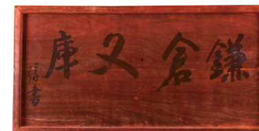
Signage written by writer Ton Satomi appears in front of the Kamakura Bunko store. Property of the Kamakura Museum of Literature.

During this desolate period in Japan, the Kamakura Writers created works using Kamakura as a motif and made Kamakura a city of literature. Their free and open spirit calls to mind the independence and pride of the samurai of ancient Kamakura. The spirit of the Kamakura Writers lives on in today's new generation of literati.