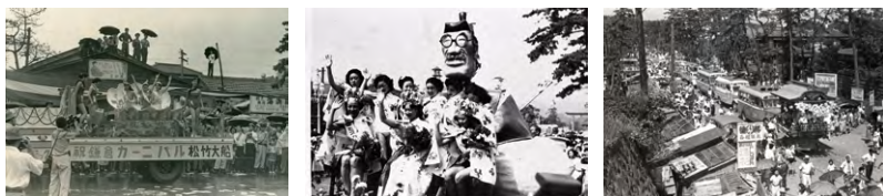
A huge parade on Wakamiya Street. People came to Kamakura from all over the country to see the carnival.

Inspired by the Nice Carnival in southern France, writers such as Masao Kume and Jiro Osaragi decided to hold the 1st Kamakura Carnival in July 1934. Except for eight years during the war, this major event was held until 1962. For the festival, a giant "deity" of the year was created and carried from Wakamiya Oji Avenue to the Yuigahama beach by a parade of people in fancy dress. Humorous "deities" such as a dragon king, Kintaro (a folk hero), Audrey Hepburn and Rikidosan (a professional wrestler) were displayed for the carnival. The number of visitors increased year by year and Kamakura became well known across Japan as "Ginza by the Sea." After the war, the carnival was revived in 1947, and was expanded to include the Miss Carnival competition, a yukata competition and dance. The population of Kamakura in those days was 80,000 but 200,000 people gathered in the city during the carnival. The photographs show a group of comic artists, including Ryuichi Yokoyama, enjoying the costume parade and Yasunari Kawabata judging the Miss Carnival competition. Written records and literary works show that this event which the Kamakura Writers themselves enjoyed brightened up the city of Kamakura.