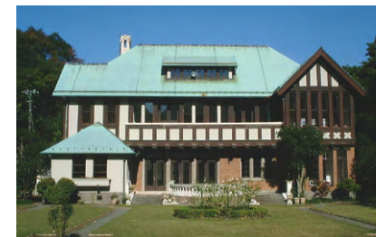
The western-style house and geometric garden are a reminder of a more flamboyant lifestyle.