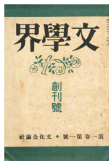
The first issue of the Bungakukai magazine. The magazine was initially published by Bunkakoronsha and later by Bungeishunjusha.

Undeterred by the war, social unrest, suppression of free speech and the death by torture of the proletarian writer, Takiji Kobayashi, writers such as Hideo Kobayashi, Fusao Hayashi, Yasunari Kawabata and Kyuya Fukada launched the Bungakukai (Literary World) magazine in 1933. This magazine was free from any political bias and was devoted to the cultivation of literature, art and culture. The magazine promoted the freedom and purity of literature by showcasing developing trends in the literary world. The writers involved included Yasunari Kawabata and Riichi Yokomitsu, neo-impressionists known for literary modernism, Hideo Kobayashi, who was inspired by modern French literature, and Kensaku Shimaki, who moved away from proletarian literature. In the editor’s postscript, Kawabata wrote, “We are seeing signs of the revival of literature.”