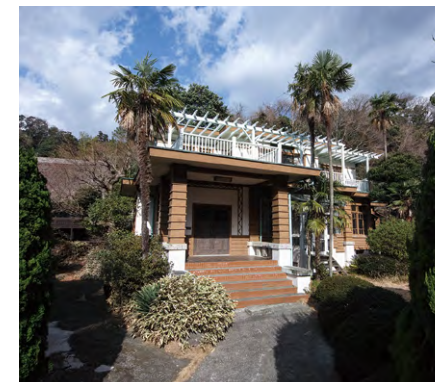
The house has an impressive porch. The western-style and Japanese-style buildings make an attractive contrast.