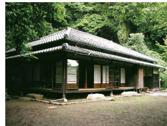
The annex, which has a covered courtyard with an earthen floor (called a doma ), a living room and a study, is open to the public in the spring and fall.