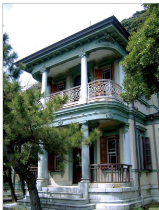
The pillars of the front balcony, the entrance and the window and door frames are gorgeously decorated.