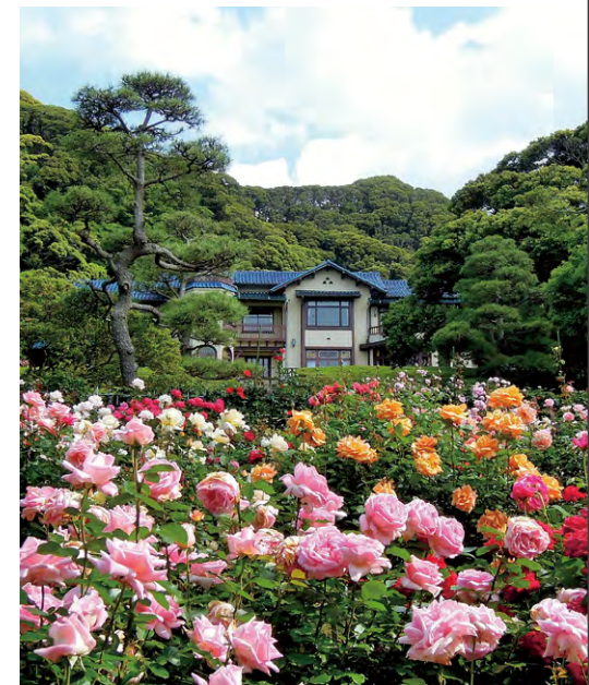
The best times to see the roses are from the middle of May to the end of June and again from the middle of October to the end of November.