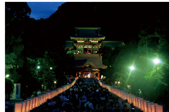
A line of lights continues from the raised path to the main shrine. The precinct becomes crowded in the evening.