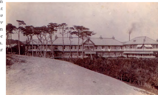
Kaihinin, just after it was transformed into the Kaihin Hotel.

Dr. Erwin von Bälz, a German medical doctor, and Sensai Nagayo, director of the Medical Affairs Bureau at the Ministry of the Interior, considered Kamakura to be an ideal destination for summer and winter sojourns and for recreation. They were proponents of sea bathing for medical purposes. The establishment of Japan's first sanatorium, named Kaihinin, in Yuigahama in 1887 made Kamakura into a popular seaside health spa. Patients at the sanatorium bathed in the sea at scheduled times. The Mitsuhashi Ryokan Inn in Hase ran an advertisement for sea bathing in the Tokyo Yokoyama Mainichi Newspaper in 1885, and in 1888 Kaihinin became the Kaihin Hotel for sea-bathers and overseas visitors. Sea bathing became a popular recreational activity in Japan.